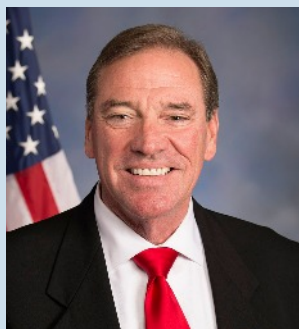
Presidential Guest Speaker Rep. Neal Dunn, MD, FACS