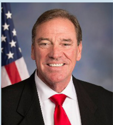
Presidential Guest Speaker Rep. Neal Dunn, MD, FACS