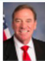
Presidential Guest Speaker Rep. Neal Dunn, MD