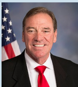
Presidential Guest Speaker Rep. Neal Dunn, MD, FACS